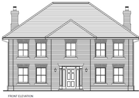
Plots 2, 4, 5, 14, 15 & 67