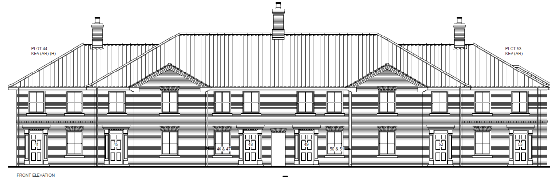
Plots 44 -53 (apartments)