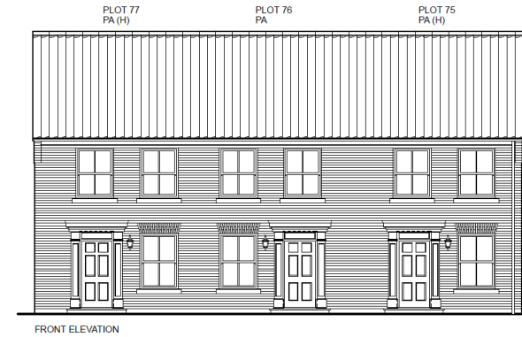
Plots 75 - 77