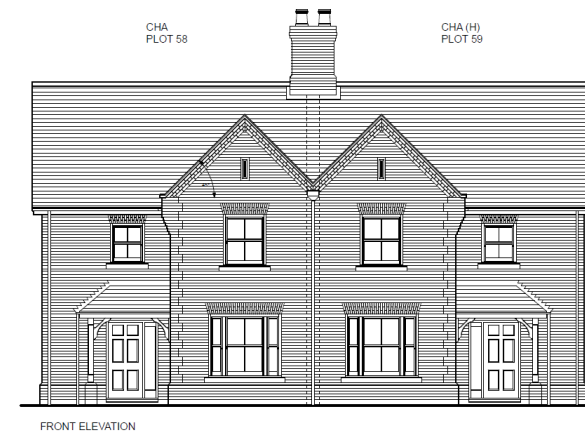
Plots 58 & 59