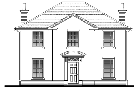
Plots 60,63,65.67 & 69