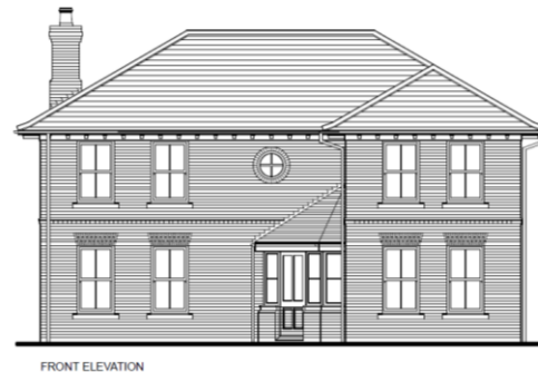
Plots 3, 6, 9, 10 & 64