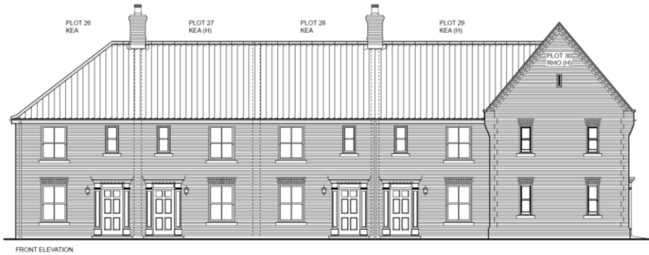
Plots 26- 30