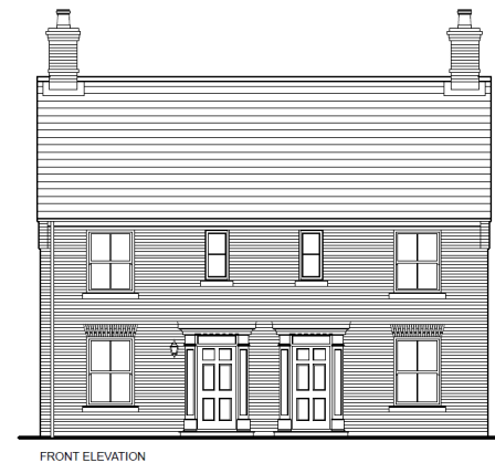
Plots 81 & 82