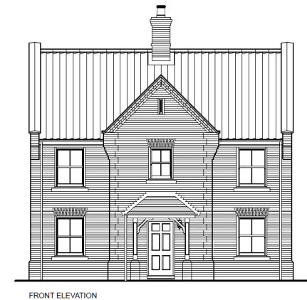
16, 62 & 80