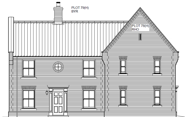
Plots 78 & 79