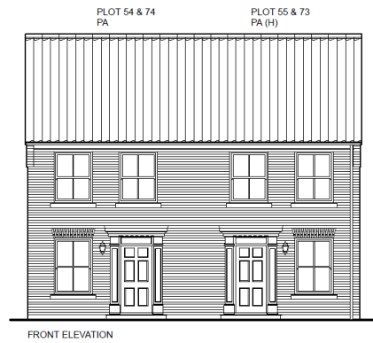
Plots 54,55 & 73,74