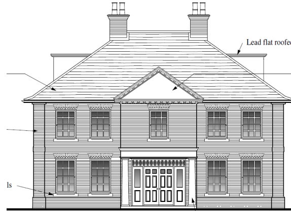
Plots 1, 3, 13 & 15