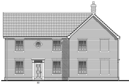
Plots 58,59,79 & 80