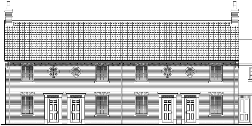
Plots 26 -29