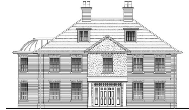
Plots 4, 5 & 11