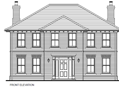
Plots 7, 8, 11, 13, 25, 63, 66 & 68