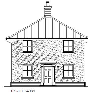
Plots 65 72 & 83